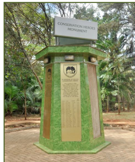
Figure 7. Conservation Heroes Monument in Kenya, with the inscription: "These great heroes died in combat with armed bandits, preventing wildlife crimes, on rescue missions and protecting property from damage by wildlife."

Corruption can occur at all levels of government. In 2015, the former wildlife director and head of the CITES Management Authority of Guinea was arrested in relation to an allegation of corruption and fraud relating to the issuance of CITES export permits. This case highlights the pervasive nature of corruption among officials and how this adds another dimension and potentially inhibiting factor to detecting and disrupting criminals involved in environmental crime.