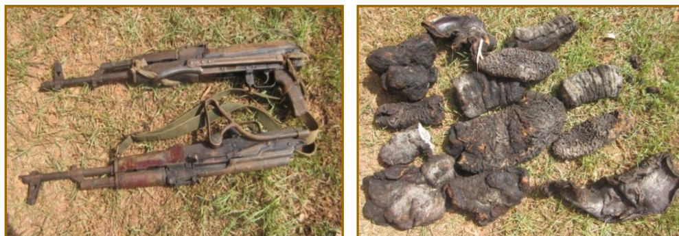
Figure 5. Photos taken during Operation Wendi by the Congolese authorities in 2013. The photo on the left shows two PMAK arms that were seized at the same time as four magazines, 1 axe, 1 saw, and 13 pieces of elephant meat and one ivory tusk.

There are also connections between ivory smuggling and illegal logging across Southern and Eastern Africa. In 2013, INTERPOL Operation Wildcat identified major smuggling networks in East Africa involved in trafficking elephant ivory and illegal shipments of timber and charcoal. Smugglers were found to be concealing ivory inside charcoal containers or inside welded chambers of trucks used to transport logs across borders (figure 6). The operation resulted in the seizure of 240kg of elephant ivory, 856 timber logs, 637 firearms, illicit drugs, 44 vehicles and the arrest of 660 people.