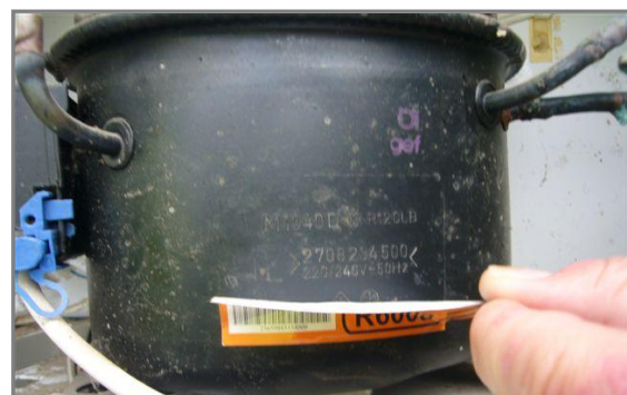
Figure 2. Concealment methods associated with pollution crime, including the use of fraudulent documents, false labels and paint.