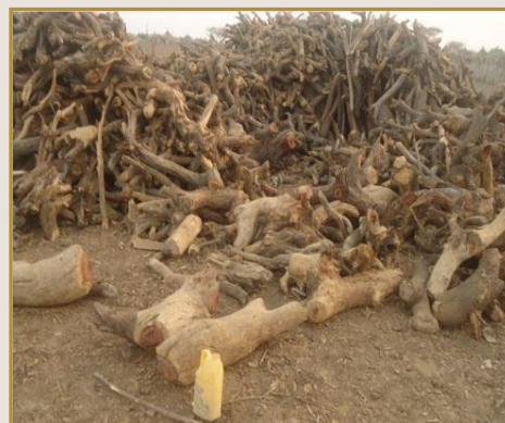
Figure 9. Forest destruction associated with charcoal production.

In 2012, the UNSC responded to the situation by imposing a ban (through the adoption of Resolution 2036) on the direct or indirect import of charcoal from Somalia to reduce “terrorist funding” and to prevent an “environmental crime” – irrespective of whether or not such charcoal originated in Somalia 6 . The ban, however, has been difficult to enforce and the revenue generated has in fact increased since being implemented. According to the UNSC, the overall size of the illicit charcoal export from Somalia has been estimated at USD360 to 384 million per year 7 .