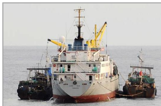
Figure 3. Transshipments from fishing vessels.