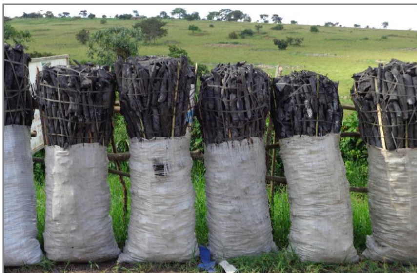
Figure 6. Charcoal uncovered during Operation Wildcat in 2013.

There are also connections between ivory smuggling and illegal logging across Southern and Eastern Africa. In 2013, INTERPOL Operation Wildcat identified major smuggling networks in East Africa involved in trafficking elephant ivory and illegal shipments of timber and charcoal. Smugglers were found to be concealing ivory inside charcoal containers or inside welded chambers of trucks used to transport logs across borders (figure 6). The operation resulted in the seizure of 240kg of elephant ivory, 856 timber logs, 637 firearms, illicit drugs, 44 vehicles and the arrest of 660 people.