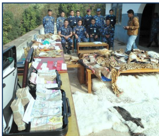
Figure 4. Successful seizure of Asian big cat skins and large sums of cash by the Nepal Police.