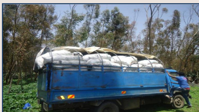
Figure 8. Illegal charcoal apprehended with the suspects in Eastern Africa.

Charcoal is made by burning wood in an enclosed area at high temperatures. Locals are hired in groups, generally comprising 10 to 20 men, by the charcoal traders. The traders provide them with supplies such as tools, medicine, money and food rations. The men are hired to cut down acacia trees, some of which are allegedly over 500 years old. The timber is then partially burnt for up to ten days in kilns dug into the earth, before being cooled for several more days. Once produced, the charcoal is bagged and loaded onto trucks for transport to storage areas at or near the export points. The workers are then paid, minus the cost of their expenses incurred during production. As the payments are insufficient to sustain themselves and their families, they return to their jobs, ultimately becoming embroiled in the production and trade of illegal charcoal.