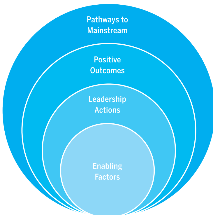
Figure 2. Building Momentum in Financial Sector Leadership Action

The remainder of this paper provides finance sector leadership examples for each of these six areas, highlighting throughout the key factors that supported leadership action to occur ('enabling factors'), a range of finance sector leadership actions that have been taken ('leadership actions'), the contribution of these actions to a more low carbon, climate resilient world ('positive outcomes') and what is needed to mainstream these leadership actions across the wider finance industry ('pathways to mainstream') (Figure 2).