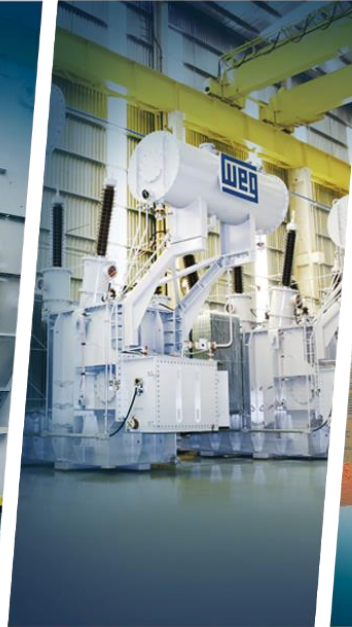
Transmission & Distribution