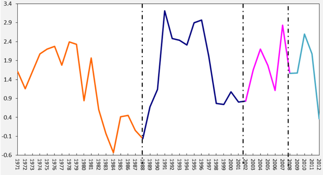
Figure 1: Net Private Capital Flows to Developing Countries (Per cent of GDP)

From the experience of developing countries, international payments crises have been associated with sudden stops in international liquidity. The most damaging episodes have followed years of booming international liquidity. In March 2011, with the intention of providing a warning on the fleeting nature of the global liquidity boom occasioned by the monetary easing-based responses of developed countries to the 2007-08 financial crisis, Akyüz (2011) published in a South Centre Research Paper a “Chart 1.b” on net private capital flows to developing countries. This chart showed that the 1982 developing country debt crisis and the 1997 financial crises which started in East Asia came from the end of liquidity booms. Figure 1 reproduces this Chart updated to 2012 data.