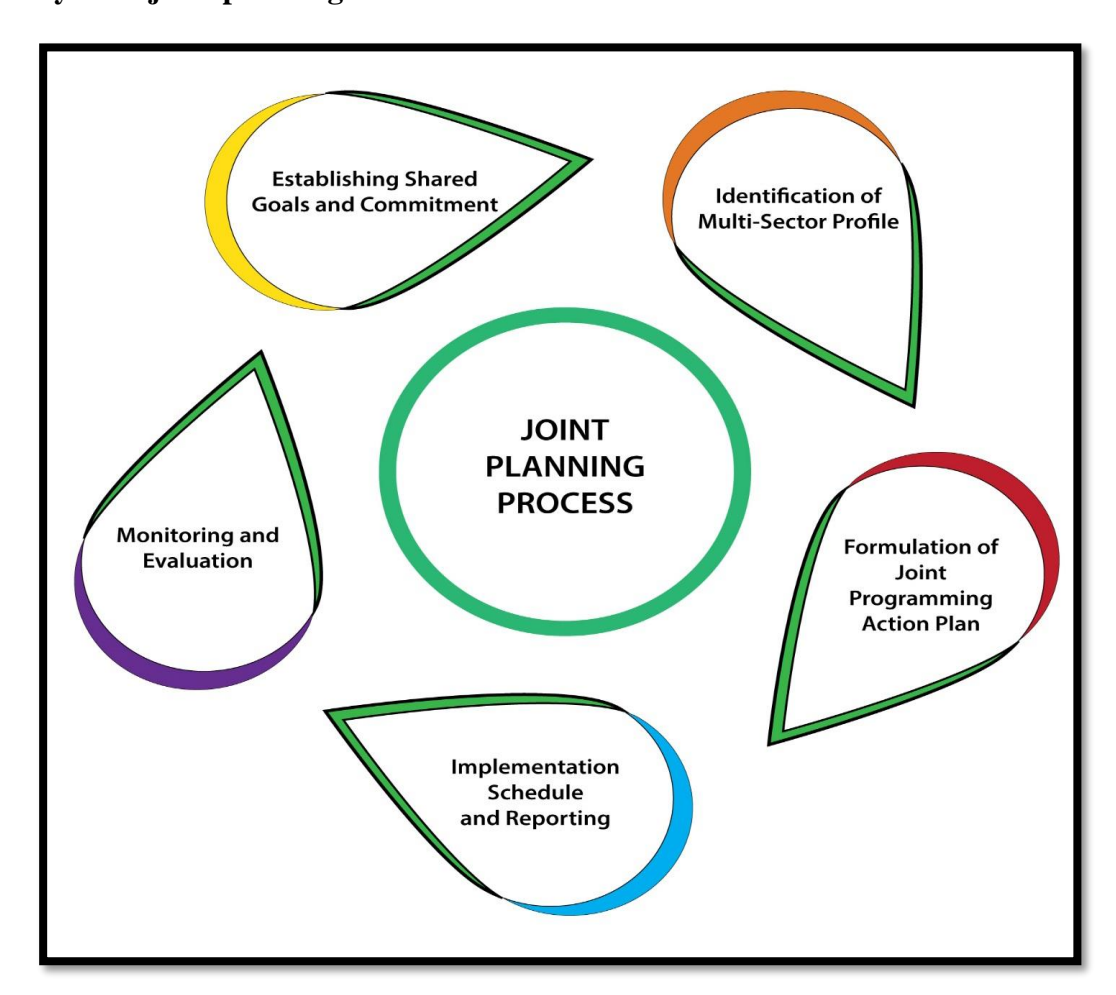
Figure 2 Cycle of joint planning

Many organizations have cycles that facilitate planning and costing, and schedules for programme implementation. The partner States and most of the regional institutions have a form of planning cycles, by way of development plans, strategic plans, business plans or project planning cycles. The cycle of planning for joint programming is depicted in figure 2 below, which distinguishes five stages of planning and implementation. A key challenge in the planning cycle, where there are multiple agents, is synchronizing the individual planning cycles.