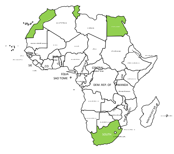
U.S. – Africa Tax Treaty Network

• Increased FDI: There is evidence to suggest a correlation between a strong tax treaty network and larger levels of foreign direct investment. For example, the UK-Africa tax treaty network is extensive compared with the United States, which has only four active tax treaties. In 2012, the UK contributed $7.4 billion in FDI inflows to Africa while the United States contributed $1.9 billion. Africa as a whole provides a high return on FDI investments compared with other destinations, so building an African tax treaty network can help catalyze investment to the continent while also giving opportunity to U.S. business. The FDI benefit comes from levelling the playing field for African countries as an investment choice for U.S. multinationals compared with the choice of other countries with which the U.S. has tax treaties.