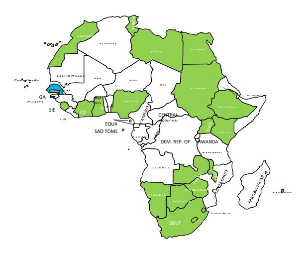
UK – Africa Tax Treaty Network