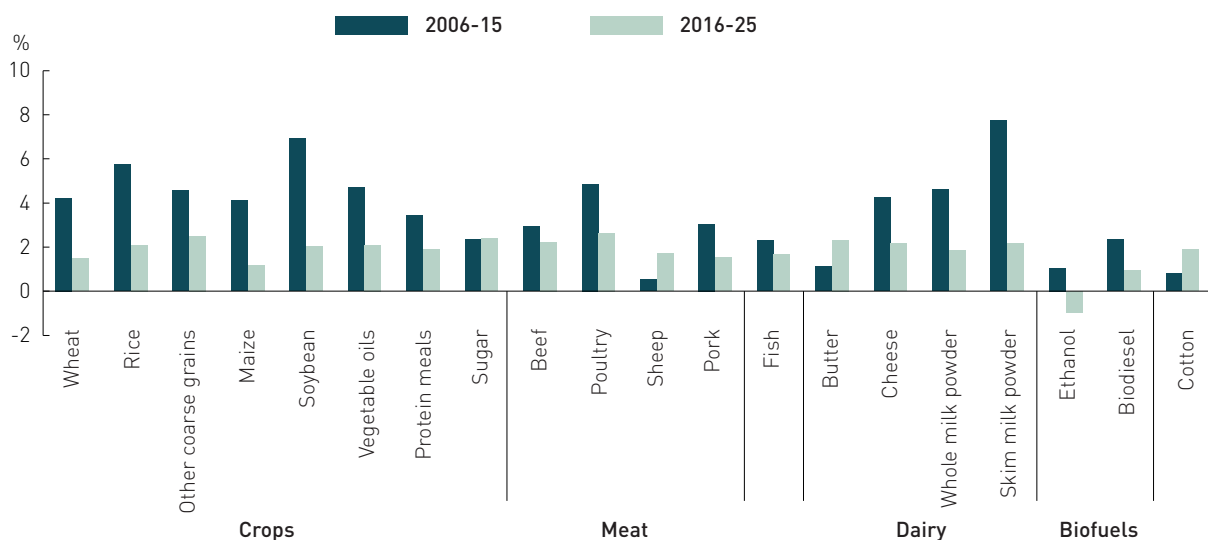
Figure 3. Growth in trade by commodity Annual growth in volume terms

In addition, there are several policy uncertainties. One relates to China's recently announced changes to its grains policy, including the setting of domestic prices and the management of stocks. The current Outlook assumes that those changes will enable China to meet its domestic objective of maintaining a high self-sufficiency ratio in maize without severely disrupting international markets. However, the timing and scale of stock release is a major uncertainty underlying the projections. A further risk relates to the Russian import ban, which is assumed to expire at the end of 2017.