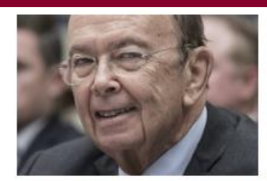
US Commerce Secretary set for Kenya visit