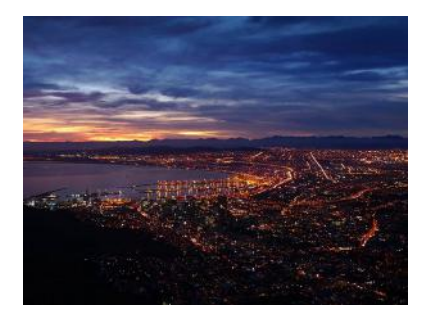
The AfCFTA: What has been achieved and when will it become operational?