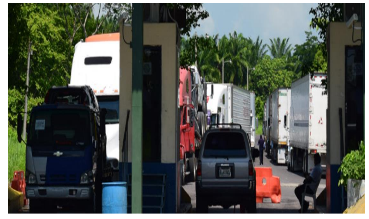
Long delays at check points