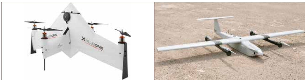
Figure 3: Examples of VTOL UAVs

VTOL, or hybrid drones, are a much more recent innovation and take advantage of the multirotor ability for vertical take-off and landing (Figure 3).