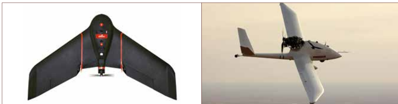
Figure 2: Examples of fixed wing UAVs

There are two main types of fixed wing UAVs: the flying wing (Figure 2, left) and the more traditional airplane configuration (Figure 2, right). Fixed wings need considerably more space for take-off and landing compared to multirotors. However, because of their improved flight dynamics, they can cover much larger areas making them ideal for applications such as surveillance, land surveys and large-scale agricultural activities.