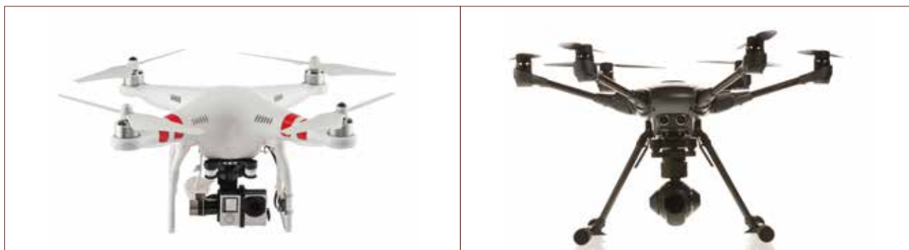
Figure 1: Examples of multirotor UAVs

Multirotor UAVs (Figure 1) are currently the most popular drone type and are defined as a UAV that uses three or more blades to achieve lift and movement. Companies like DJI 1 and Parrot 2 have been able to commoditize the multirotor type drones, forcing down the price and thus removing the cost barrier to using UAVs. The simple rotor mechanics utilized by these UAVs have greatly reduced the complexity associated with piloting such craft. With better flight control, multirotor aerial vehicles have been extensively used in applications such as aerial photography and site inspections. One key advantage that multirotors have over fixed wing UAVs is that they have vertical take-off and landing meaning they need very little space to be deployed.