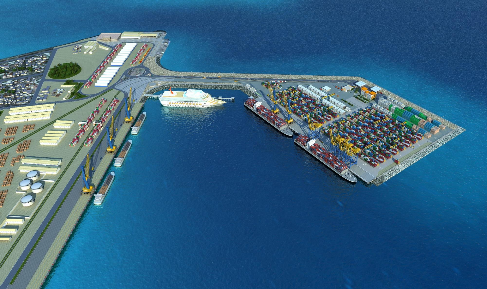
The New Port of Walvis Bay Container Terminal