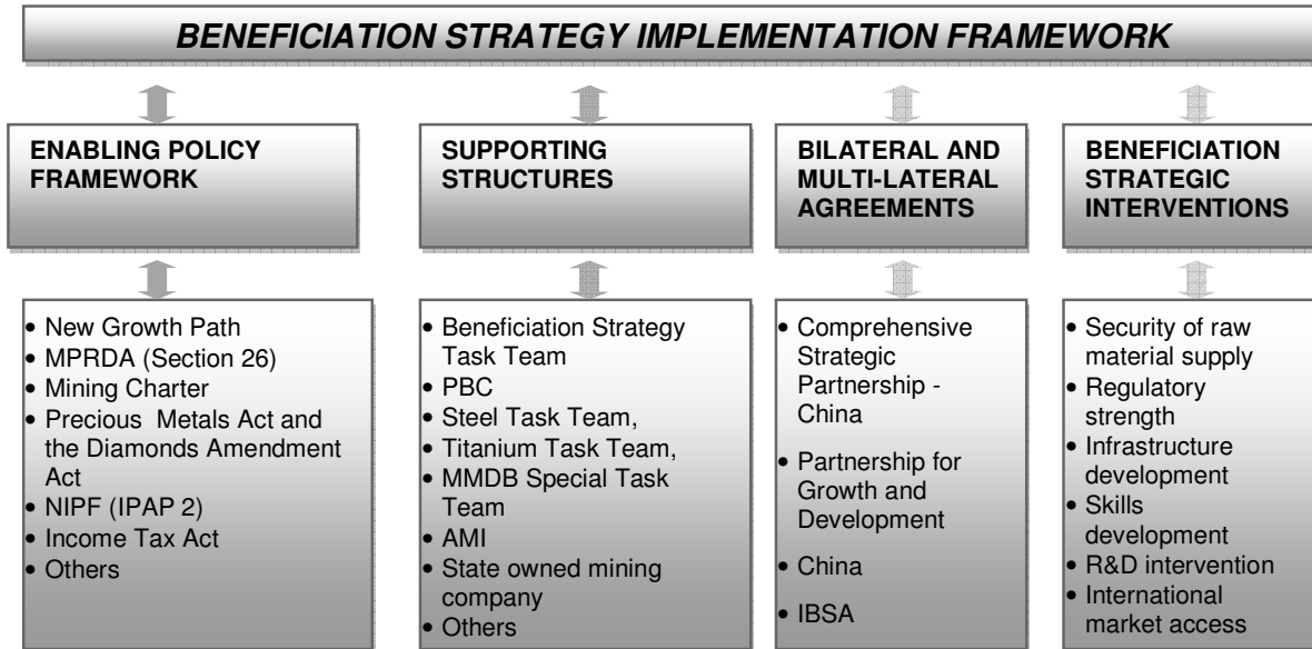
FIGURE 1: THE BENEFICIATION STRATEGY IMPLEMENTATION FRAMEWORK

The document highlighted the cross-cutting constraints affecting effective beneficiation, for all minerals. The interventions are primarily intended to identify and recommend remedial action to mitigate the impact of such identified constraints to the development of the beneficiation sector.